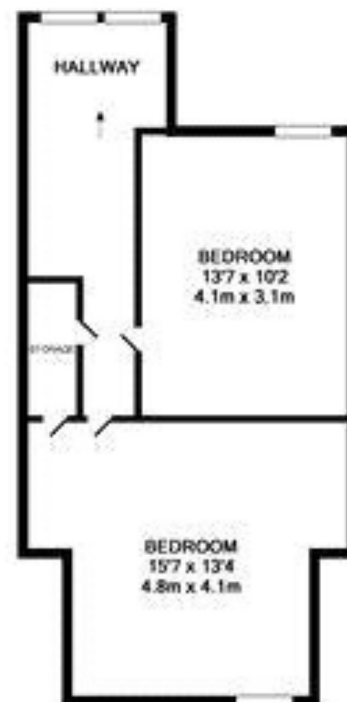
2ND FLOOR APPROX. FLOOR AREA 430 SQ.FT. (39.9 SQ.M.)

TOTAL APPROX. FLOOR AREA 1834 SQ.FT. (170.4 SQ.M.)