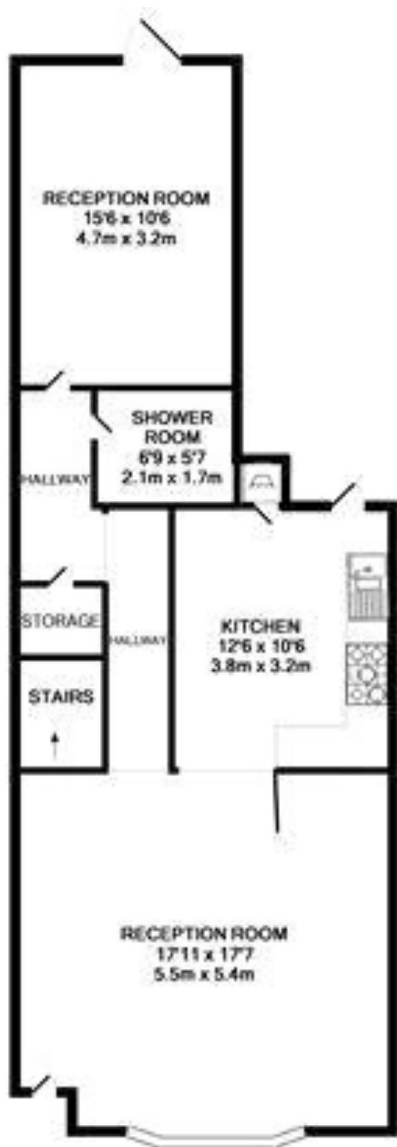
GROUND FLOOR APPROX. FLOOR AREA 753 SQ.FT. (69.9 SQ.M.)